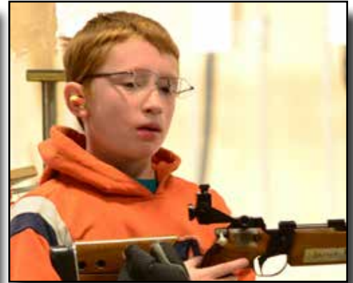
Junior sporter and precision marksmen met on the firing line to compete in the 3x20 GAI match.