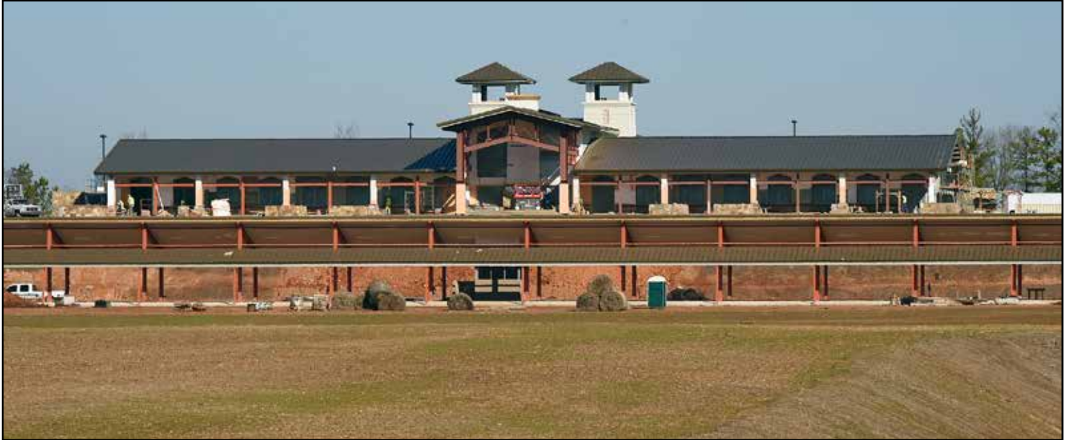
The 13,000 square feet of the CMP Park Club House overlooks the 600-yard range. Giant windows give view to the firing line and the natural Alabama landscape.

TALLADEGA, AL – Be witness to and take part in a new chapter in marksmanship history at the Civilian Marksmanship Program Talladega Marksmanship Park as the first official matches are fired on Saturday, June 6 and Sunday, June 7, 2015.