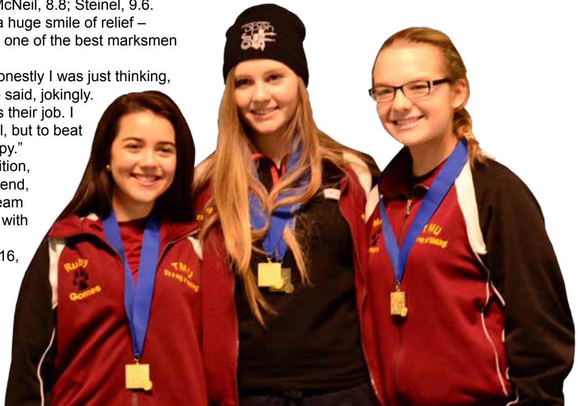
The Taunton Marksmanship Unit Diamonds was the overall Junior Rifle team in the 60 Shot match. The ladies also won the overall team competition in the 3x20 match.