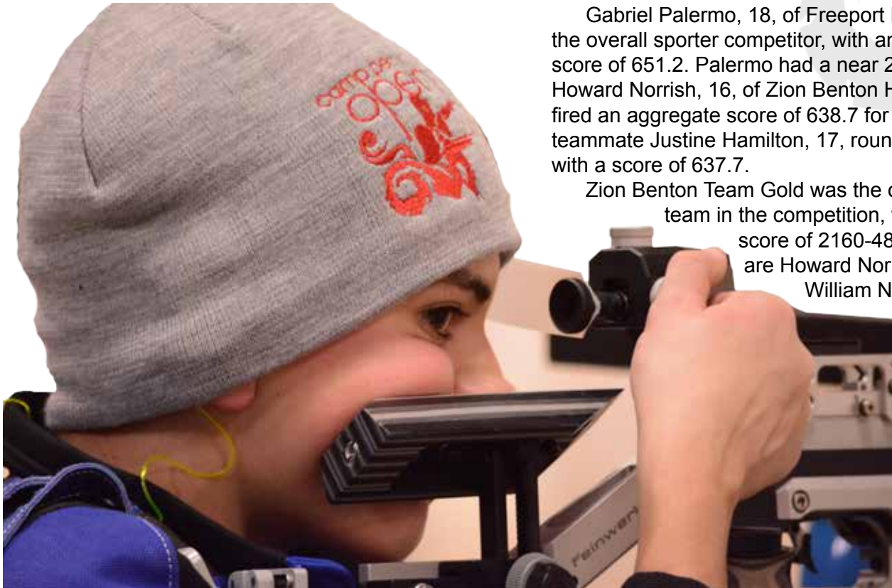
Over 300 marksmen made the trek to northern Ohio to fire in the 2015 Camp Perry Open, January 16-18.

The rest of the weekend brought a two-day 60 Shot Open Air Rifle and Pistol competition, divided into three categories: Junior, Team and Open. All shooters fired 60 record shots in accordance to