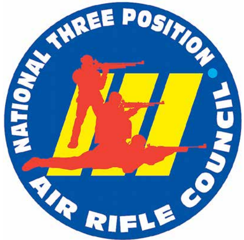
The National Three-Position Air Rifle Council, comprised of 11 national youth-serving organizations, approves the National Standard Rules that govern 3PAR shooting.

Strong Local Clubs and Teams. Council decisions consistently favor strengthening local clubs and teams and opposing changes that would weaken local clubs