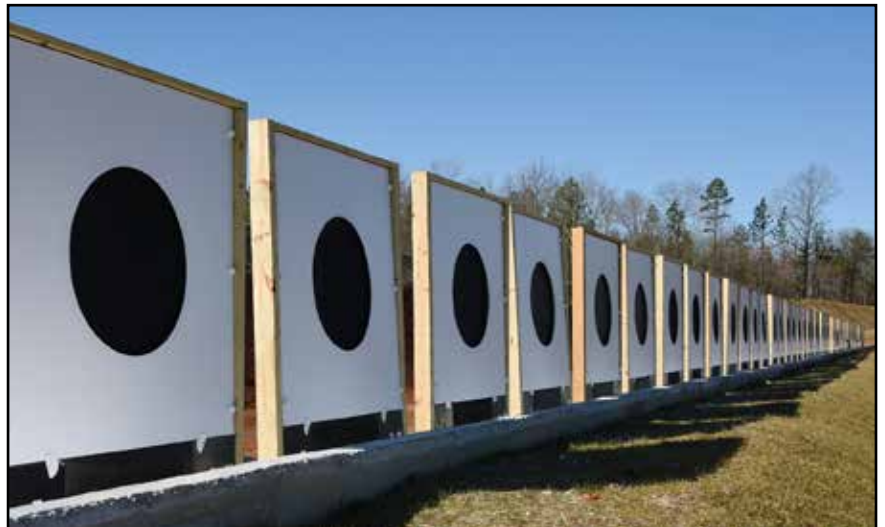
Each firing point is equipped with state-of-the-art electronic targets that automatically display scores on a monitor next to the competitor.

The 500-acre facility – located two miles from the world-famous Talladega Superspeedway – features a 600-yard rifle range with targets at 200, 300 and 600 yards, a 100-yard multi-purpose range and a 50-yard