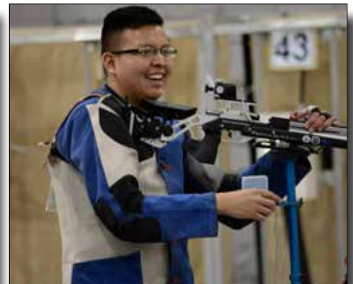
Smiles were contagious at the western JROTC Regionals in Phoenix, AZ!