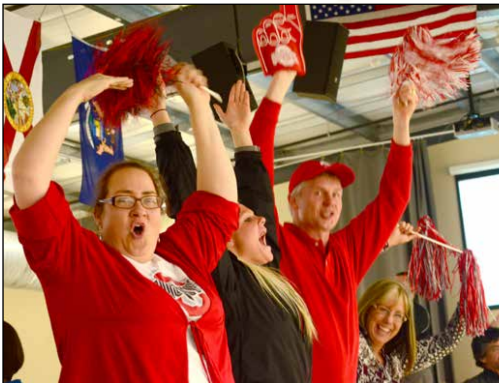
The Ohio State University fans waved pom poms and foam fingers during the event, as well as took the time to pose for the university's signature O-H-I-O.