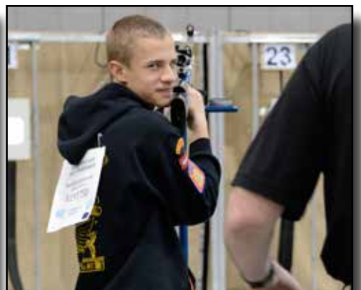
The CMP photographer has been caught!