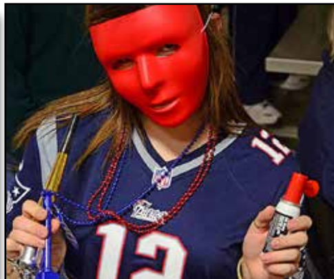
Some crowd members dressed from head to toe during the Super Finals at the Camp Perry Open, adding to the fun.