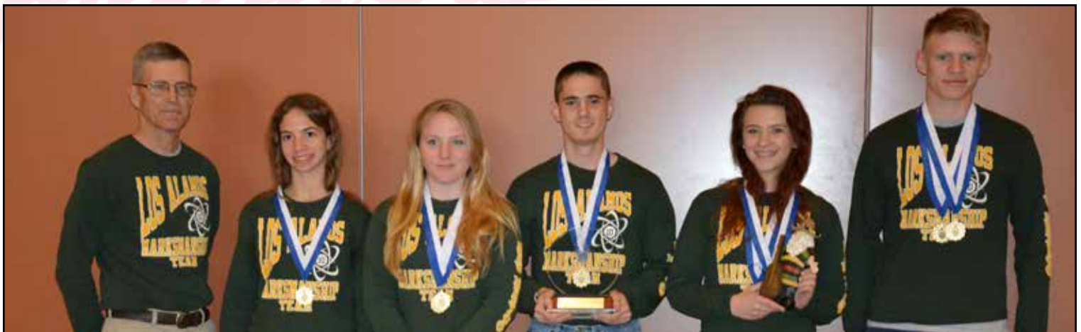
Los Alamos High School in New Mexico placed first overall in the Navy precision team competition with their score of 4597-245x.

The JROTC National Championship for all services will be held in the Gary Anderson CMP Competition Center at Camp Perry, OH – March 19-21, 2015.