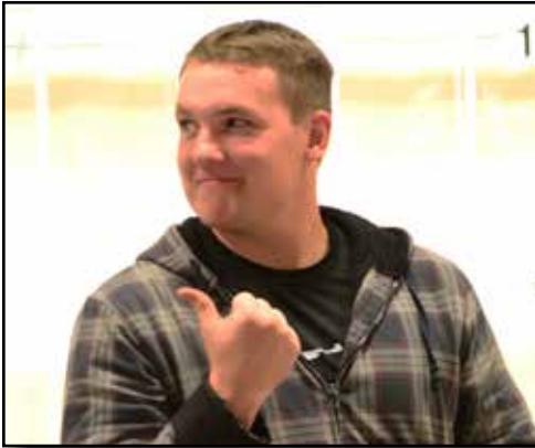
Thumbs up for making the finals at the 2014 Gary Anderson Invitational (GAI)!

Junior shooters left their mark on several recent CMP events including the Gary Anderson Invitational, Camp Perry Open and JROTC Regionals.