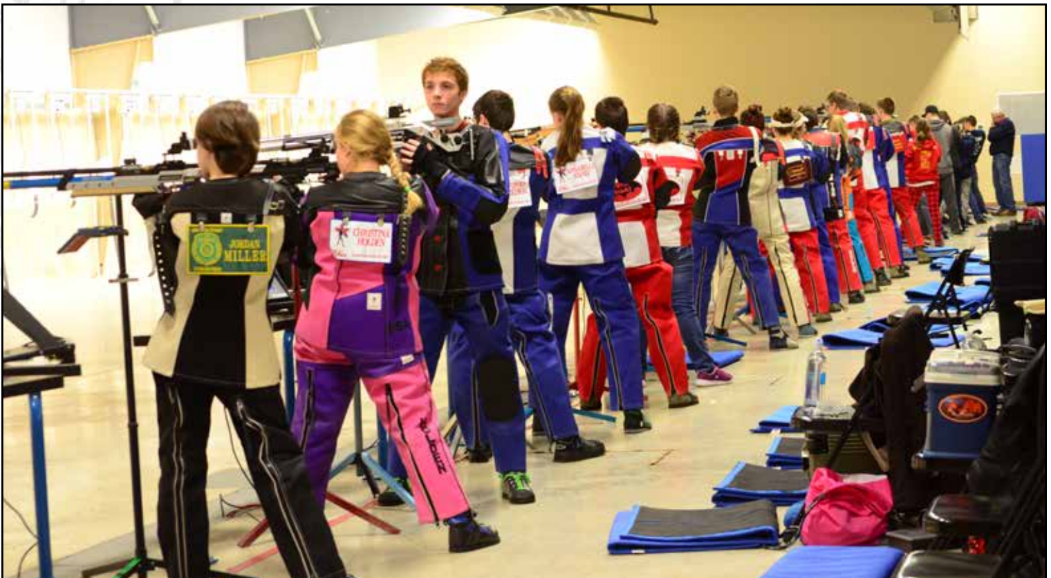
The Gary Anderson Invitational is a three-position air rifle tournament that follows the 3x20 course of fire. Each shooter fires 20 record shots from prone, standing and kneeling positions, with the Top 8 shooters advancing to the final. The event is sanctioned by the National Three Position Air Rifle Council and is open as a CMP Cup match.

See photos of the Gary Anderson Invitational at http://cmp1.zenfolio.com/