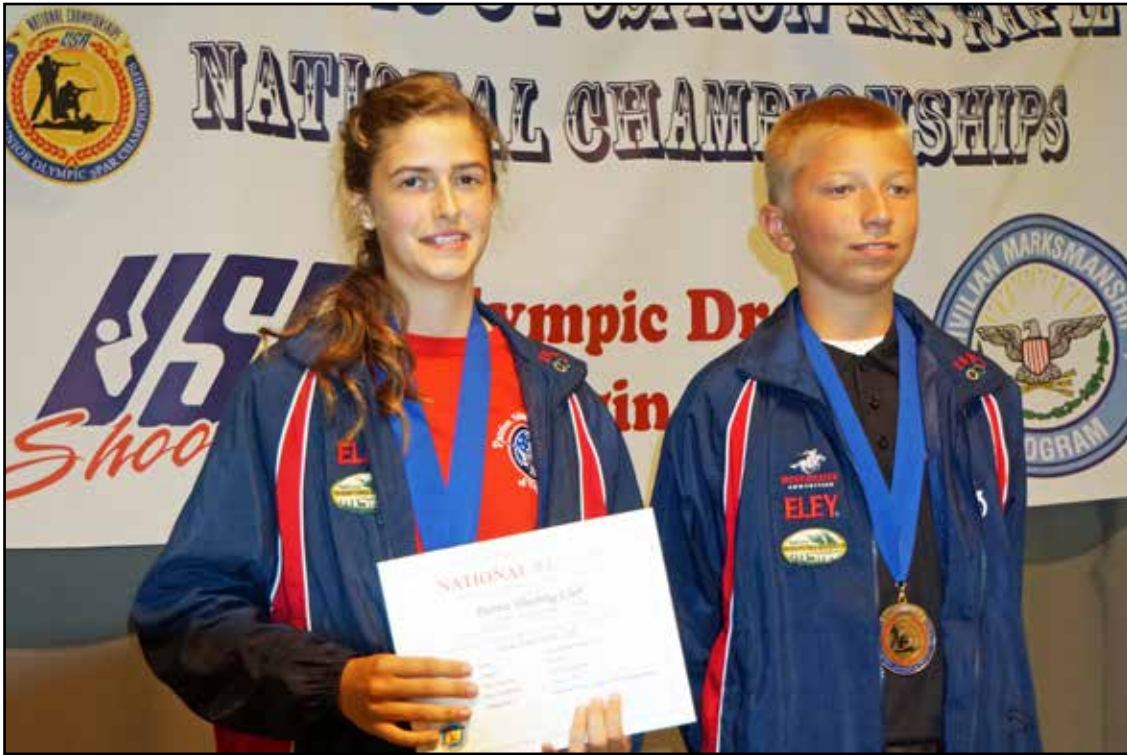
Junior athletes who compete and win in major 3PAR Precision Class National Championships are already well advanced in following the Olympic Path.