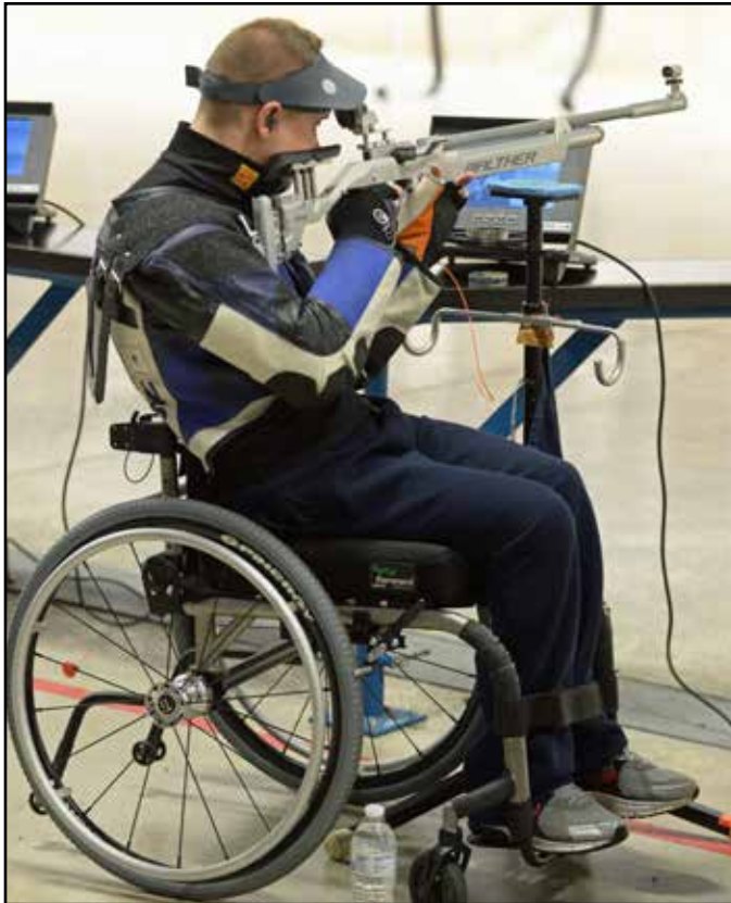
This athlete is firing in an “adapted” standing position for wheelchair athletes. Athletes who use adapted positions approved for IPC SH1 class athletes can compete with all athletes in 3PAR competitions on a relatively equal basis.

3PAR Rules still allow athletes to challenge close shots, but more and more match sponsors are deciding not to allow challenges because they are fundamentally unfair. If challenges are allowed and made, the original computer scan can be rescored, but if the athlete loses the challenge, a two-point penalty must be applied to the score of that shot. Other countries where electronic scoring systems like Orion are used permit the correction of obvious errors, but prohibit rescoring correctly scored shots. German Shooting Federation Rules, for example, state, “only one method of scoring may be used” and that when an electronic vision system is used “the scoring rings may not be used” and “it is not permitted to use a scoring gauge.”