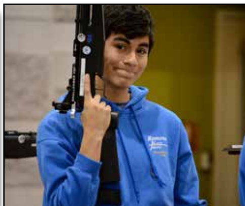
Never hurts to throw a grin at the camera every now and then!