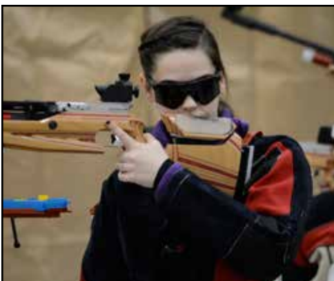
The sun never sets on CMP air rifle competitors.