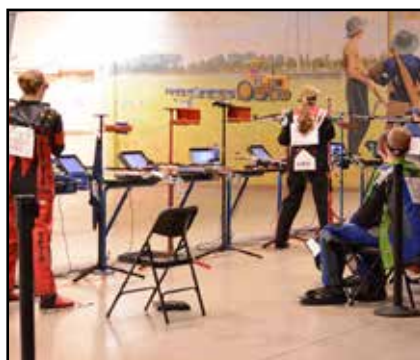
Camp Perry Open.....4