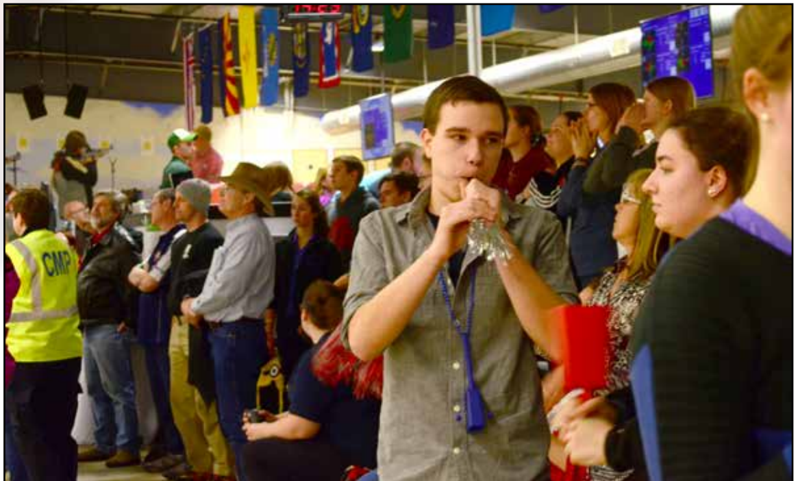
During the Super Final, the crowd blew air horns and party blowers, cheered at the tops of their lungs and heckled the competitors on the firing line – all in an attempt to distract and all in good fun.

To see photos from the Super Final, visit the CMP Zenfolio page at cmp1.zenfolio.com .