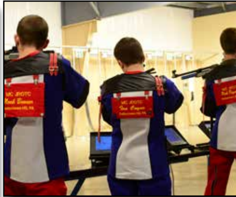
Clubs teams and JROTC teams went head-to-head at the Gary Anderson Invitational at Camp Perry in December.