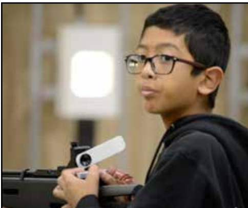
The JROTC Regionals decided which talented marksmen would be advancing to Nationals in March.