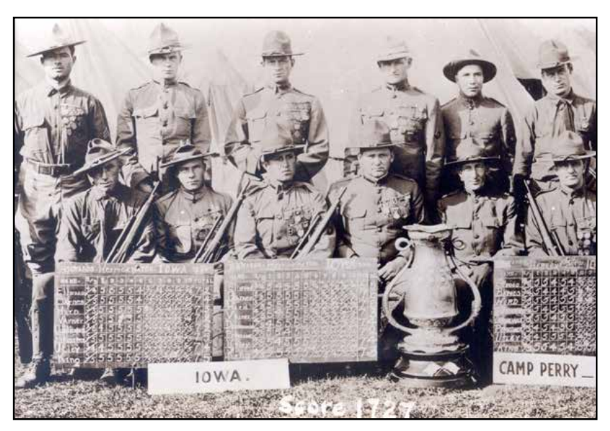
A winning Iowa Rifle team at the 1913 Camp Perry Rifle Matches. They are shown with their trophy and scoreboards. The rifles are 1903 Springfields with Winchester A5 scopes.

From its inception in the early part of the 20th Century, a major function of the Civilian Marksmanship Program was to conduct the Annual "National Matches" that have become its tradition. In addition to competitions for a growing collection of "National Trophies," the matches included Small Schools Arms Firing that taught thousands